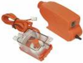
PAGES 253 - 256 Condensate Pumps