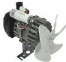
PAGES 257 Ice Machine Pumps