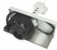
PAGES 258 Water Ice Pumps