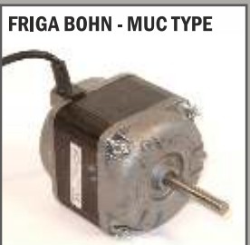
FRIGA BOHN - MUC TYPE A replacement to fit Friga Bohn MUC mono models 84FM25S-8