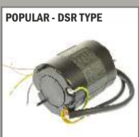
POPULAR - DSR TYPE Replacement for DSR12-83 33FS25-1