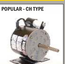
POPULAR - CH TYPE Suitable alternative for C6H range coolers 90w 120FS90