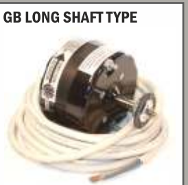
GB LONG SHAFT TYPE Popular motor for GB cases 33FDF372