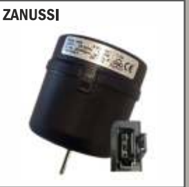
ZANUSSI 96mm diameter fridge fan 20TM1S-1