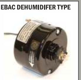
EBAC DEHUMIDIFER TYPE Fan motor that is suitable for EBAC and other similar dehumidifiers 33FS4-1