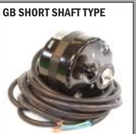
GB SHORT SHAFT TYPE Popular motor for GB cases 33FDS101