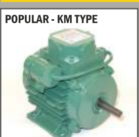
POPULAR - KM TYPE Popular replacement for KM coolers 63FS200-1 1PH 63FS200-3 3PH