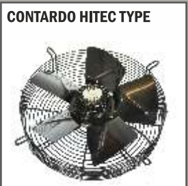
CONTARDO HITEC TYPE HiTec esternal rotor fan fits onto HC Range (330mm) 3 options available