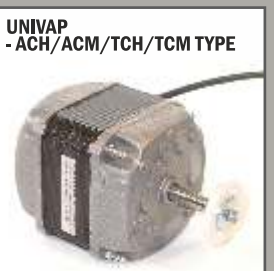
UNIVAP - ACH/ACM/TCH/TCM TYPE 34W motor which fits various univap models 84FS34-1