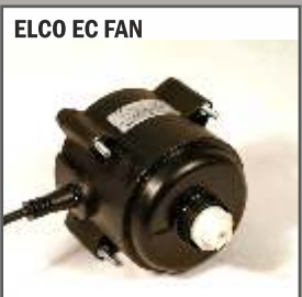
ELCO EC FAN Popular energy saving motor hexagon hub ECFM12-2M