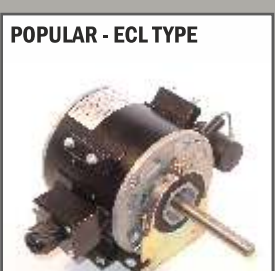
POPULAR - ECL TYPE Replacement for ECL45-120 48FS90-2