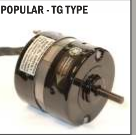
POPULAR - TG TYPE Replacement for T2-T6 coolers 15W 33FS15-1