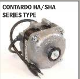
CONTARDO HA/SHA SERIES TYPE Fan motor to suit Contardo HA & SHA Coolers (plug) 84FM9S-1