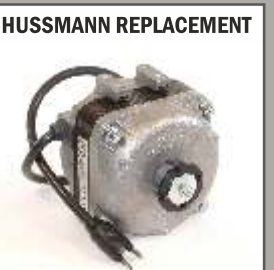
HUSSMANN REPLACEMENT Fan motor to suit Husmann PE5889 84FM9S-1