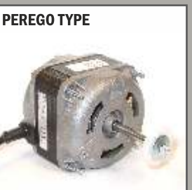
PEREGO TYPE Popular replacement mPerego motor 84FM25S-5