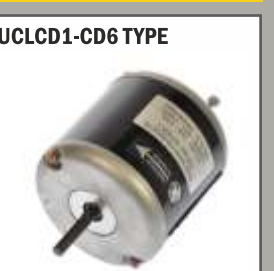
UCLCD1-CD6 TYPE Replacement for UCL 35-180 33TS35-1

All references to manufacturers names, model or part numbers and any depiction by photographs or drawings are solely for guidance, reference and identification. No connection, endorsement or approval by any manufacturer is either given or implied. The customer is solely responsible for ensuring correct motor suitability in intended application. Errors and omissions excepted.