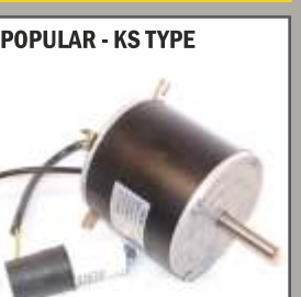
POPULAR - KS TYPE Highly popular replacement for KS coolers 70W 105FS70