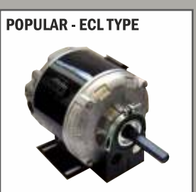
POPULAR - ECL TYPE Replacement for ECL 250W 60FM250R-4