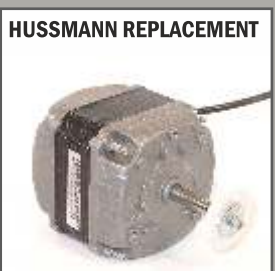
HUSSMANN REPLACEMENT Fan motor to suit Husmann PE3607 84FS20-1