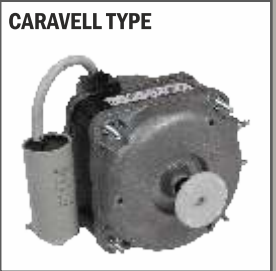
CARAVELL TYPE Replacement for some Caravell monoblock units 84TM18S-1