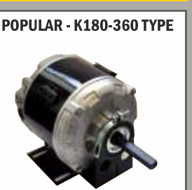
POPULAR - K180-360 TYPE Replacement for K coolers 350W, 180-360 range 60FM250R-4