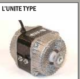
L'UNITE TYPE Popular 18W motor with in-line fixings fits L'unite condensing units 84FS25-3