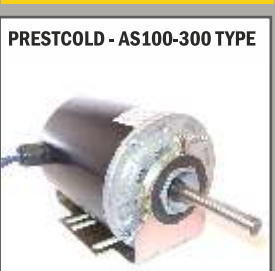
PRESTCOLD - AS100-300 TYPE Replacement motor for AS100-300 48FS120-1 1PH 48FS120-3 3PH