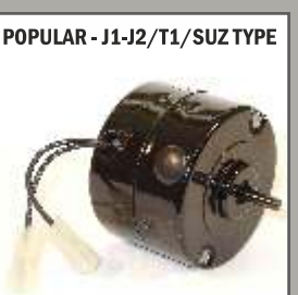
POPULAR - J1-J2/T1/SUZ TYPE Replacement for J1-J2 coolers T1 and SUZ, 7W high speed 33TS7-1