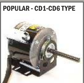
POPULAR - CD1-CD6 TYPE Fan designed to fit CD1-CD6 coolers 90W 48FS90-3