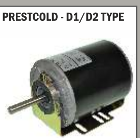
PRESTCOLD - D1/D2 TYPE Replacement motor for D1 & D2 48FS180-1 1PH 48FS180-3 3PH