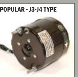
POPULAR - J3-J4 TYPE Replacement for J3-J4 coolers 33FS15-1