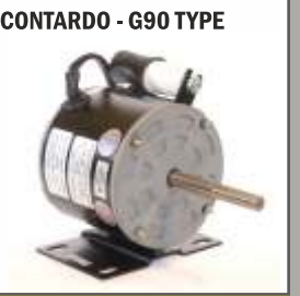
CONTARDO - G90 TYPE Replacement for G90 & NDF-77 to 190 & NCF-87 to 220 120FS90