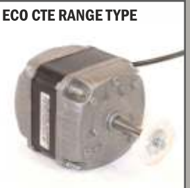
ECO CTE RANGE TYPE A replacement motor which fits Evo CTE models 84FS20-1