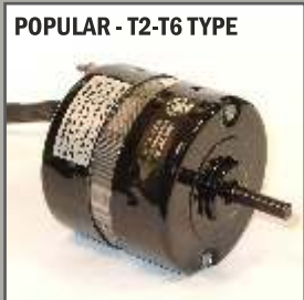
POPULAR - T2-T6 TYPE Replacement for T2-T6 coolers 15W 33FS15-1