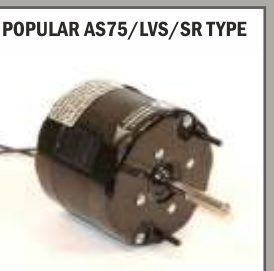
POPULAR AS75/LVS/SR TYPE Popular 18W motor for AS75 LVS70-9-, SR45-240 33FS18-1