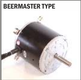
BEERMASTER TYPE Suitable motor for Beermaster Range 105FS70