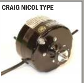
CRAIG NICOL TYPE Replacement for Craig Nicol Ambassador cases 33FS7-1