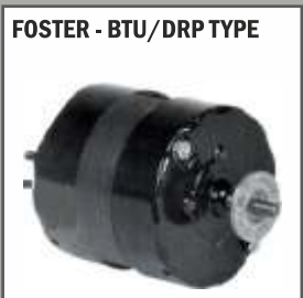
FOSTER - BTU/DRP TYPE Alternative motor that fits Foster BTU & DRP units 33TR33-1