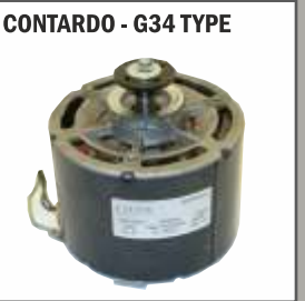
CONTARDO - G34 TYPE Replacement motor for G34 120FM34S-1